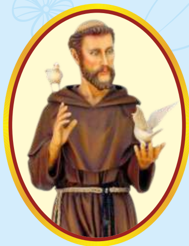
St. Francis of Assisi